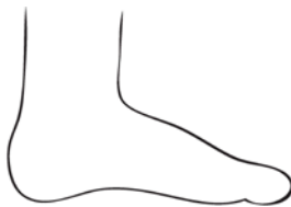
INSIDE OF FOOT