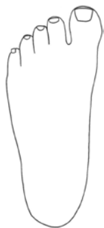
TOP OF FOOT