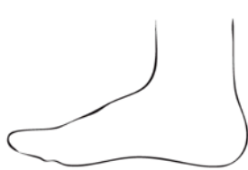
OUTSIDE OF FOOT