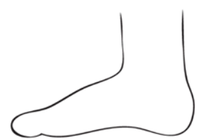
INSIDE OF FOOT

I HEREBY AUTHORIZE FOOT & ANKLE ASSOCIATES, LTD. TO TREAT ME IN ANY WAY THAT IS APPROPRIATE AND TO FURNISH INFORMATION TO MY INSURANCE CARRIER CONCERNING MY ILLNESS AND TREATMENT. TO THE BEST OF MY KNOWLEDGE, I HAVE ANSWERED THE QUESTIONS ON THIS FORM ACCURATELY. I UNDERSTAND THAT PROVIDING INCORRECT INFORMATION CAN BE DANGEROUS TO MY HEALTH. I UNDERSTAND THAT IT IS MY RESPONSIBILITY TO INFORM THE DOCTOR AND OFFICE STAFF OF ANY CHANGES IN MY MEDICAL STATUS. I AGREE THAT FOOT & ANKLE ASSOCIATES, LTD. MAY REQUEST AND USE MY PRESCRIPTION MEDICATION HISTORY FROM OTHER HEALTHCARE PROVIDERS OR THIRD PARTY PHARMACY BENEFIT PAYORS FOR TREATMENT PURPOSES. I HEREBY ASSIGN TO THE PHYSICIAN ALL PAYMENTS FOR MEDICAL SERVICES RENDERED TO ME AND MY DEPENDENTS. I UNDERSTAND THAT I AM RESPONSIBLE FOR ANY MEDICAL BILLS NOT PAID BY MY INSURANCE CARRIER.