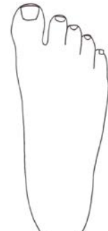
TOP OF FOOT