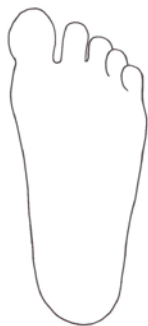
BOTTOM OF FOOT