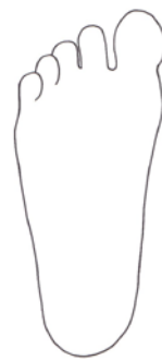
BOTTOM OF FOOT